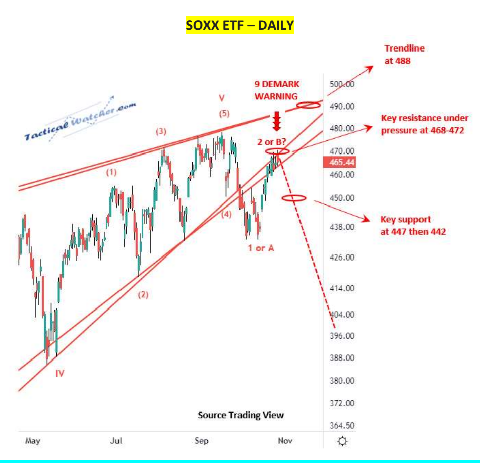
3/4 of "wave 1 or A" has been retraced, while a 9-demark warning is now flashing. If our scenario is correct, it is time to reverse on the downside. Confirmation required below the key support.

Last but not least, as mentioned yesterday, the current fortnight will see the main part of the 3Q earnings season in the US.