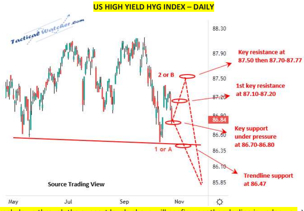
Any break down through the support levels above will confirm another decline is under way. Valid as long as the key resistance holds.